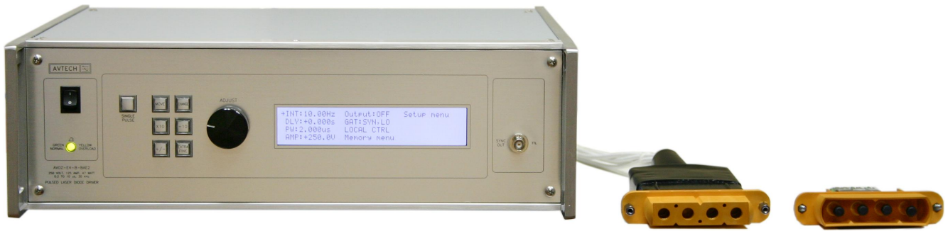
AVOZ-E4-B, with AV-HLZ2-100 output cable and mating AV-HLZA2 Adapter / Test Load