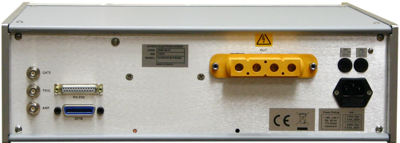
AVOZ-E4-B Rear Panel